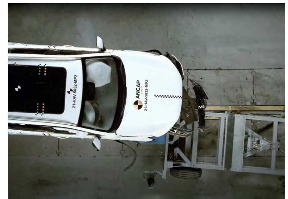
ANCAP Safety test

This bold and stylish SUV is also unbelievably safe. The Haval H6 comes with a comprehensive suite of safety systems designed to protect you and others on the road. Advanced safety features including Intelligent Adaptive Cruise Control, Lane Keep Assist, Traffic Sign Recognition, Traffic Jam Assist, and Auto Parking Assist* all combine to give you peace of mind knowing that GWM is looking out for you and everyone else around you every time you drive.