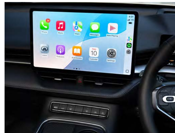
Wireless Apple CarPlay & Android Auto