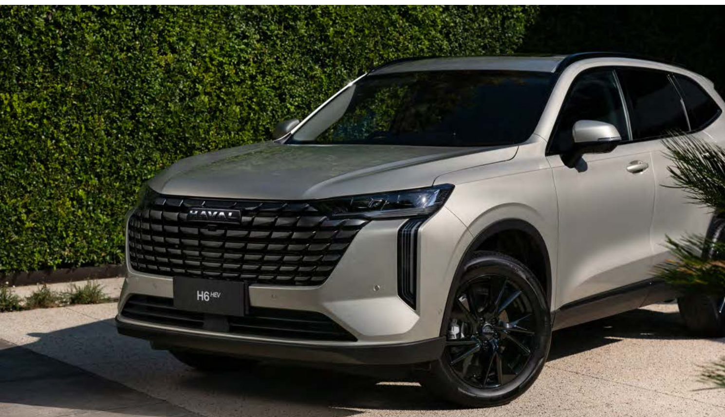
Signature front grille

From the impressive front to the stylish back, every inch of the H6 has been meticulously considered. Whether you're ducking out to the shops, or roaming far on a road-trip, your most versatile accessory will always be with you.