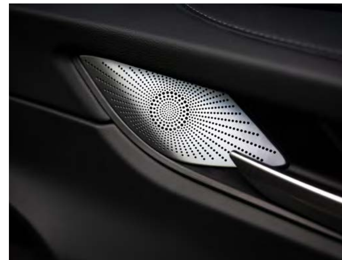
9 speaker audio system*

The H6 is a technologically advanced SUV designed for those who want more in life. Features such as auto parking assist, a 14.6" multimedia touchscreen and a heated faux leather steering wheel give this SUV its distinct edge.