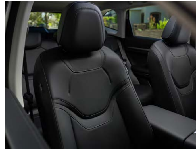
8-way electric adjustable driver seat*