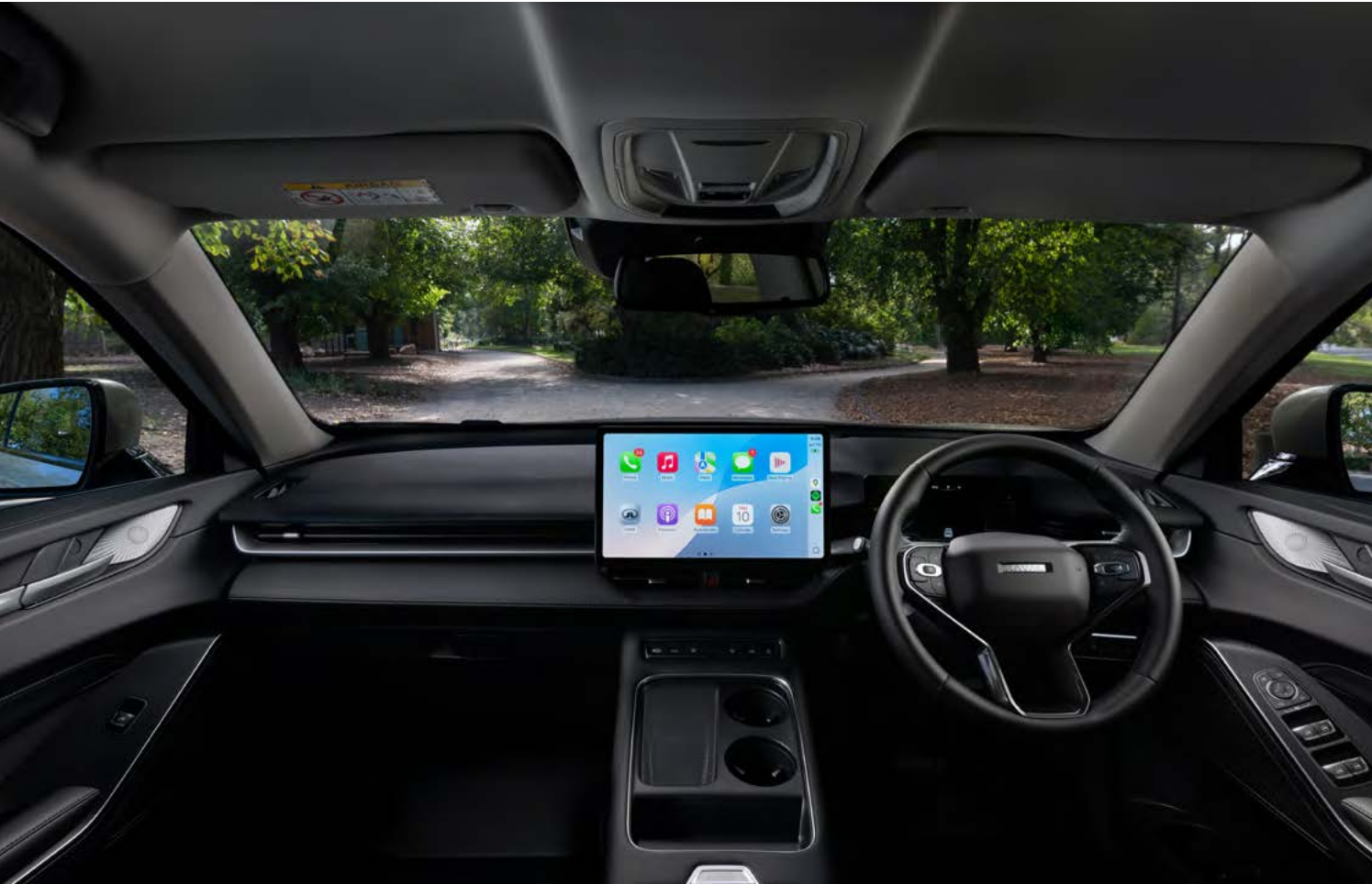
14.6" Infotainment screen