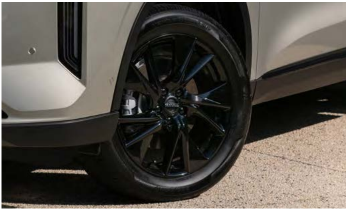
19" Alloy wheels