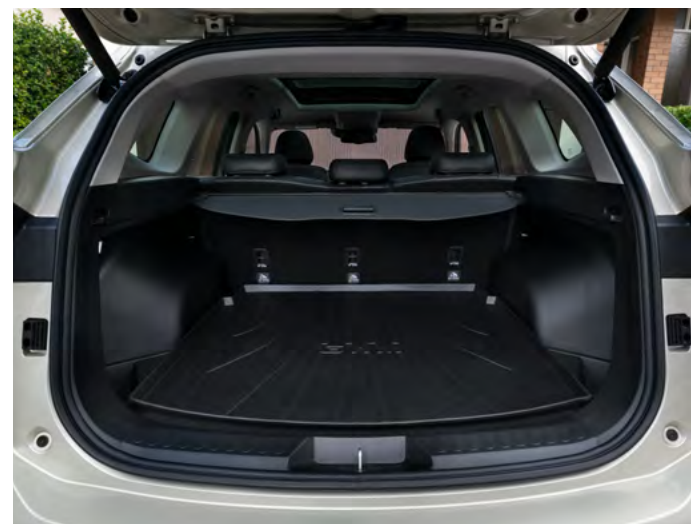
560L boot capacity (1485L max)

The H6 is a technologically advanced SUV designed for those who want more in life. Features such as auto parking assist, a 14.6" multimedia touchscreen and a heated faux leather steering wheel give this SUV its distinct edge.