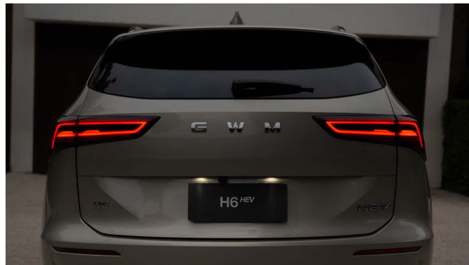
Electric kick sensing tailgate