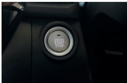
SMART KEYLESS ENTRY AND A PUSH START BUTTON.