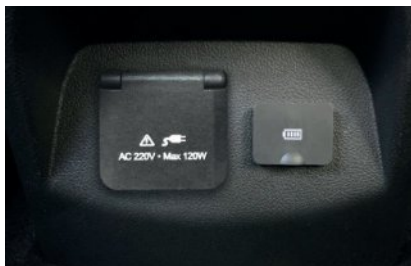
220V POWER OUTLET.

The ACC automatically adjusts the vehicle speed to maintain a safe following distance.