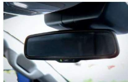
AUTO-DIMMING MIRROR & DASHCAM POWER OUTLET.